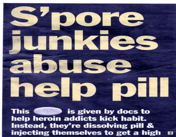
Figure 2. Singaporean newspapers against buprenorphine

market. This is an indication of a fairly large-scale diversion and abuse, in part due to the medical profession not being adequately familiar with the treatment of chronic opiate dependent patients, especially those with long histories of multiple incarcerations, antisocial behaviors and personality disorders. The study also showed that 53.3% of subjects only started intravenous drug use, after the introduction of buprenorphine. Since it is well documented that the injection of medications designed for oral consumption puts the abuser at a risk of harm from the rapid onset of drug effect, local injury and vascular injury, these findings are of concern, as buprenorphine is prescribed only for sublingual use (Figure 2).