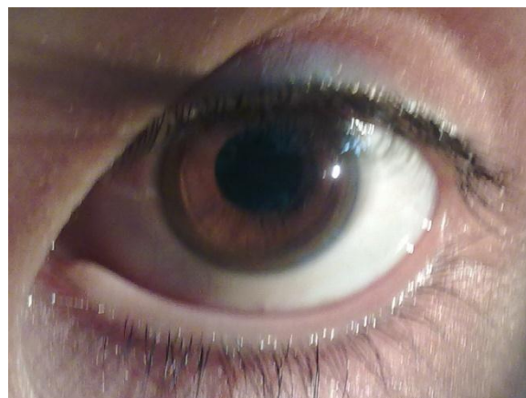
Figure 2. Kayser-Fleischer ring

detected. Forces and DTRs were normal. Other examinations were normal.